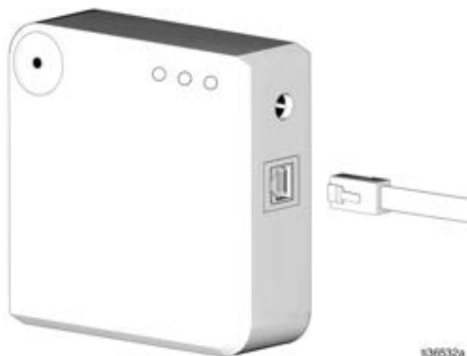
FIG. 3: Connecting Ethernet