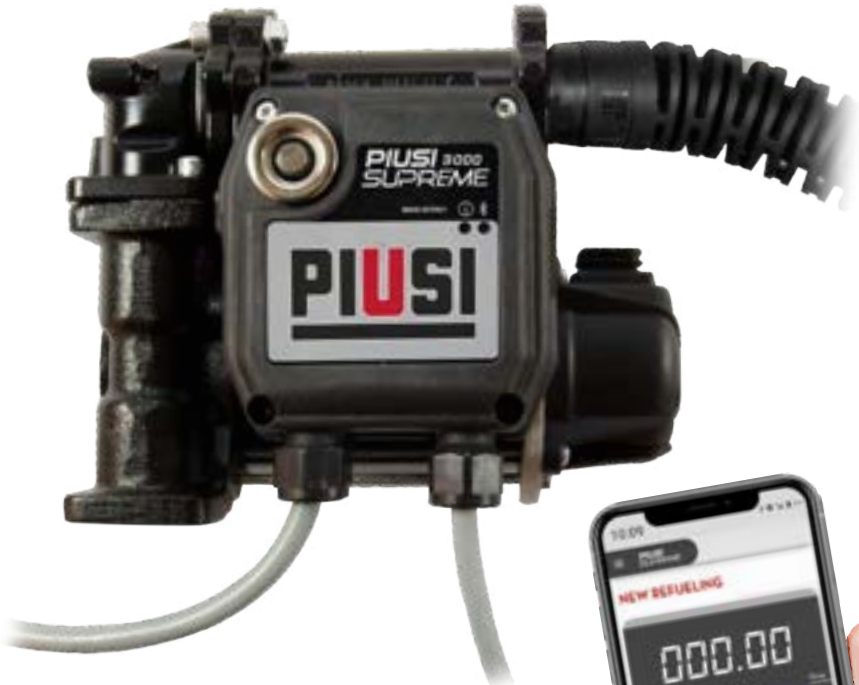
PIUSI 3000 SUPREME