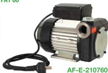
AF-E-210760 PA2 80