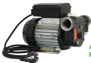
AF-E-210750 PA1 60