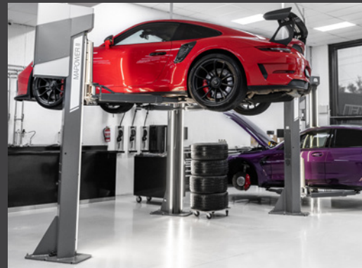
MAHA MAPOWER II | Two Post Lift EMS EURO MOTORSPORT