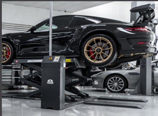
MAHA Automotive Service Scissor Lift EMS EURO MOTORSPORT