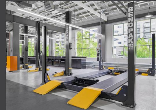
Bendpak Four-Post Hoist MELBOURNE CITY TOYOTA