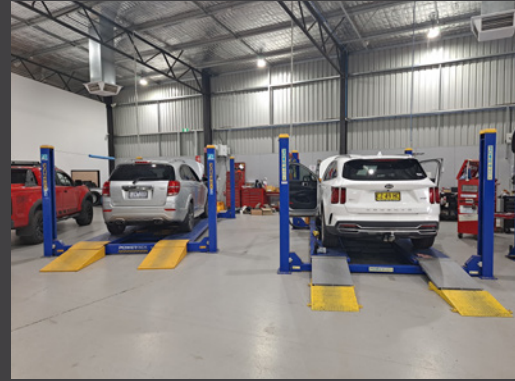
Powerrex Lift 6000 MILDURA MOTOR HOLDINGS