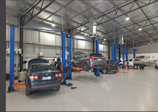
Two Post Column Lift MILDURA MOTOR HOLDINGS