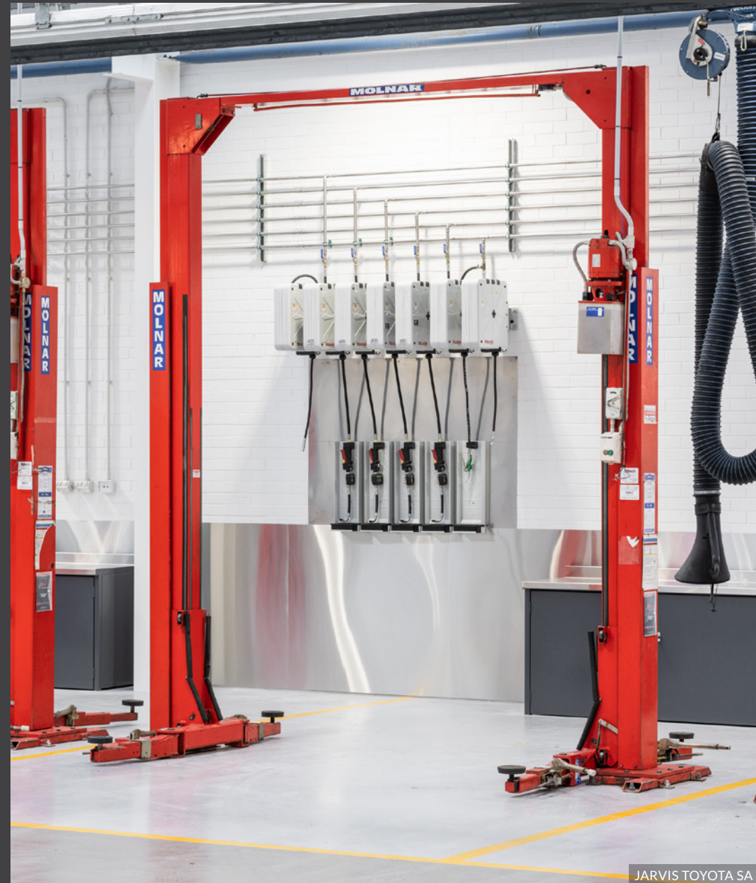
JARVIS TOYOTA SA

A-FLO Equipment offers extensive after-sales services, including online service manuals, equipment servicing, maintenance, and a variety of accessories to tailor your hoists to specific workshop needs. Contact our team to find out more about our service and maintenance programs.