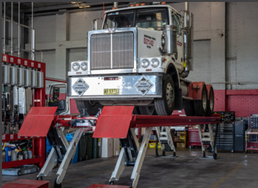
Stertil Koni Skylift K&S FREIGHTERS