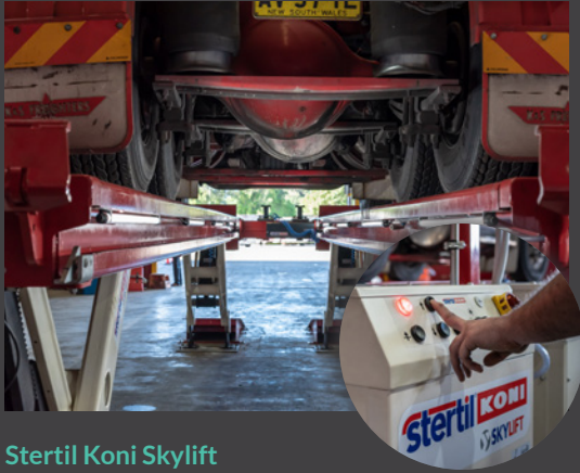
Stertil Koni Skylift JJ RICHARDS