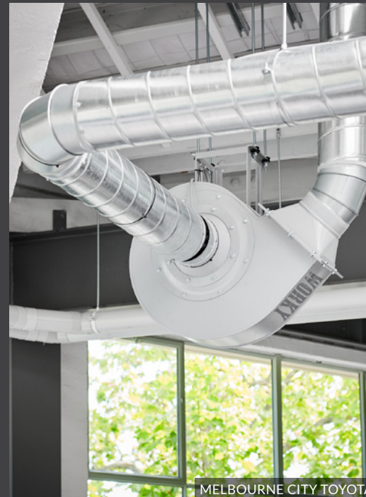
MELBOURNE CITY TOYOTA