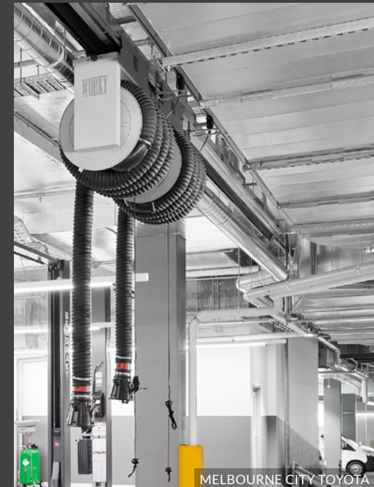
MELBOURNE CITY TOYOTA