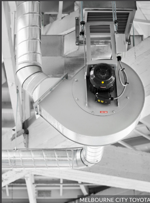
MELBOURNE CITY TOYOTA