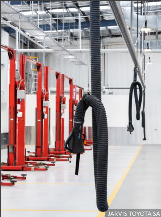
JARVIS TOYOTA SA

Protecting the health and safety of your mechanics is our top priority. With our systems in place, you can create a safer work environment.