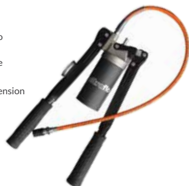
AF-SGS-450 Speedy Grease Gun - 450g