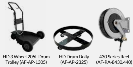
HD 3 Wheel 205L Drum Trolley (AF-AP-1305) HD Drum Dolly (AF-AP-2325) 430 Series Reel (AF-RA-8430.440)

These kits are ideal for small to medium size workshops looking to upgrade from hard pumps but also covers larger workshops that have additional 105C Oil Drums that need catering for.