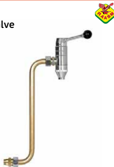
AF-RA-37683 Oil Dispensing Valve - 3/4" Connection Thread