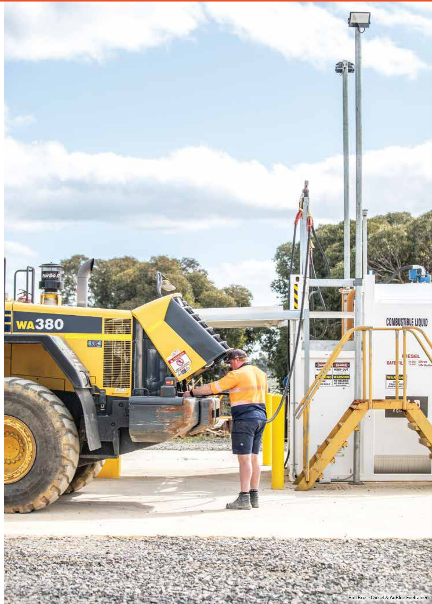
Bull Bros - Diesel & AdBlue Fueltainer