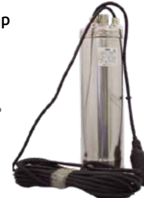
AF-PPA-KP350-A-1 240V SS Submersible Pump only