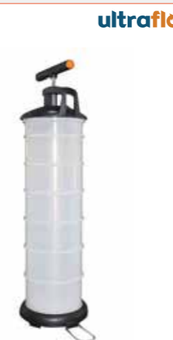
AF-AP-MW0E6.5 6.5L Manual Waste Oil Extractor