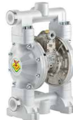
AF-RA-2B3-16117EA5 RAASM 1/2" Diaphragm Pump EPDM Membrane