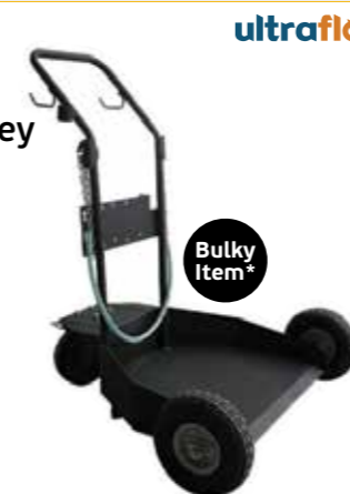
AF-AP-1305 HD 3 Wheel Drum Trolley 180kg - 205L Drums