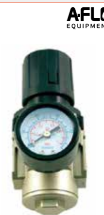
AF-PS-REG-02 1/4" Air Regulator Gauge