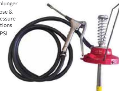
AF-AP-2290 Mini Grease Pump Kit - 2.5kg