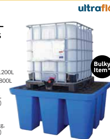
AF-SC-1IBCLL ULTRAFLO LL Series Poly Single IBC Spill Pallet