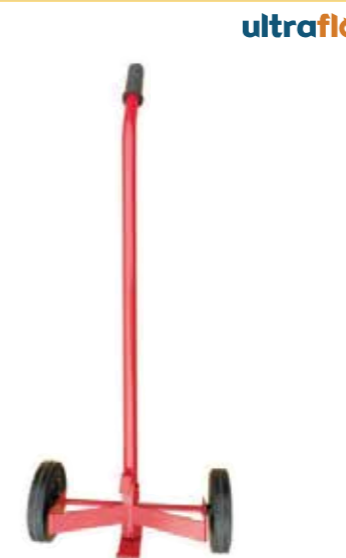
AF-AP-1300 20L Hand Drum Trolley