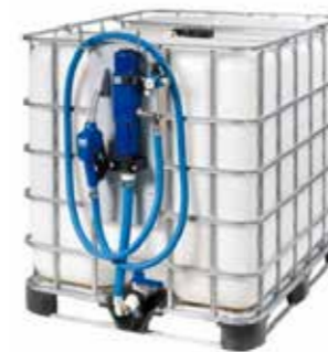
AF-AE-KP21A Bluequip IBC Kit, Auto Nozzle