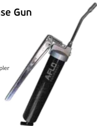
AF-UF-L450 HD Lever Action Grease Gun - 450g