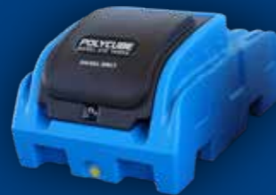
AF-FC-ECO200 200L Diesel Tank

with 12V Standard Pump Kit 800mm (L) x 757mm (W) x 450mm (H) 23kg