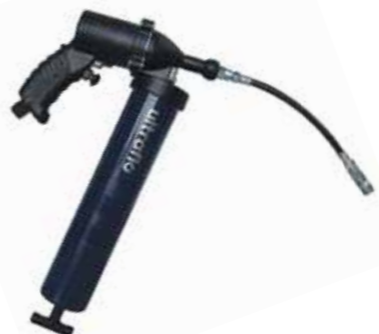
AF-AP-1161 Air Operated Grease Gun - 450g