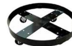
AF-AP-4325 HD 20L - 20kg Drum Dolly