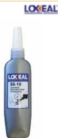
AF-LX58-10 100 Loxéal 58-10 Thread Sealing 100mL