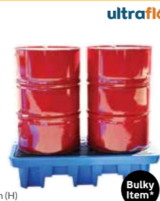
AF-SC-205LL2D ULTRAFLO LL Series Poly 2 Drum Spill Pallet