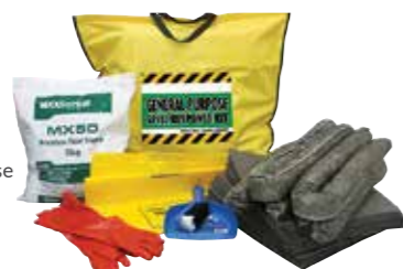
AF-SC-40LGSK General Purpose Spill Kit