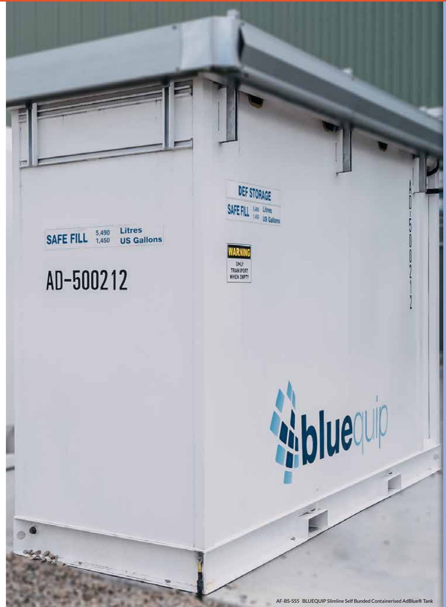
AF-BS-SS5 BLUEQUIP Slimline Self Bunded Containerised AdBlue® Tank