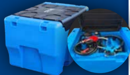
AF-FC-ECO300-50 300L Diesel & 50L AdBlue Combo

with 12V Standard Pump Kit 1050mm (L) x 747mm (W) x 570mm (H) 35.8kg