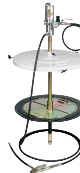
AF-RA-64031 RAASM 50:1 Ratio Air Operated Grease Kit - 20kg AF-RA-64145 RAASM 50:1 Ratio Air Operated Grease Kit - 60kg AF-RA-64195 RAASM 50:1 Ratio Air Operated Grease Kit - 180kg