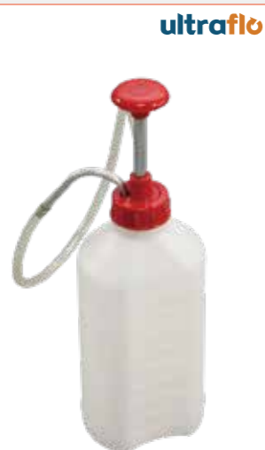
AF-AP-8100 1L Multi-Purpose Bottle Pump