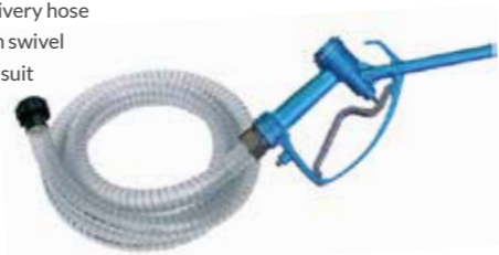
AF-FP-155170 IBC Gravity Feed Kit