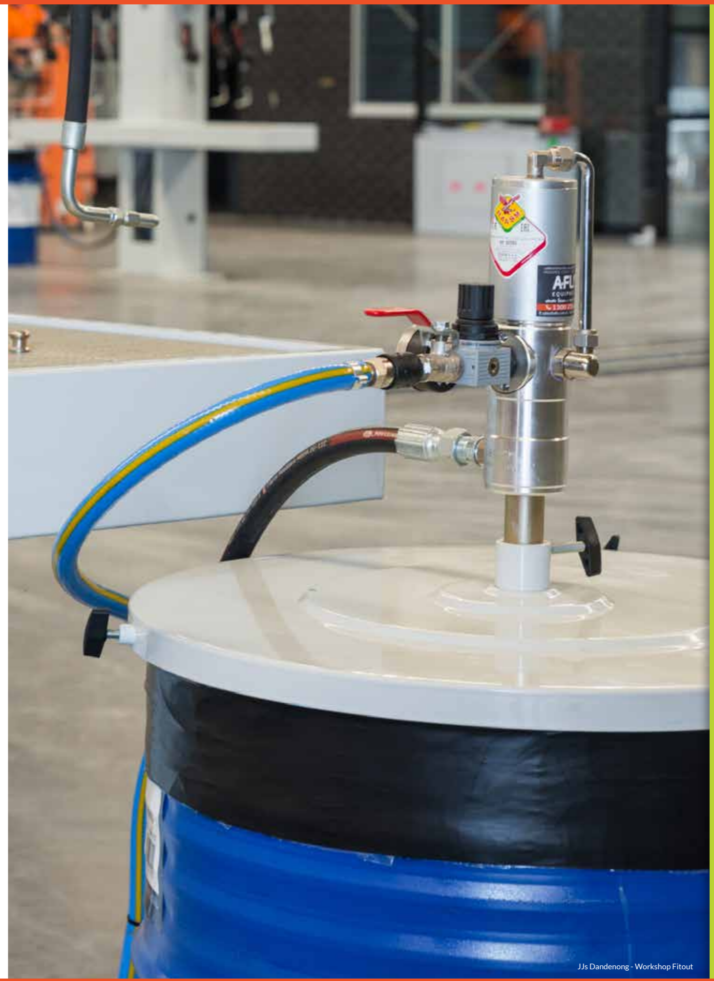
JJs Dandenong - Workshop Fitout