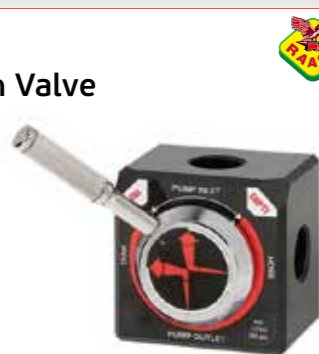
AF-RA-38131 RAASM 1" BSP (f) 4-Way Evacuation Valve