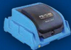
AF-FC-ECO100 100L Diesel Tank

with 12V Standard Pump Kit 800mm (L) x 757mm (W) x 450mm (H) 23kg