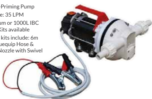
AF-FP-204000 Bluequip 12V Transfer Pump