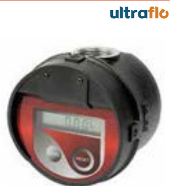
AF-A-102100B ULTRAFLO 1/2" Inline Digital Oil Meter