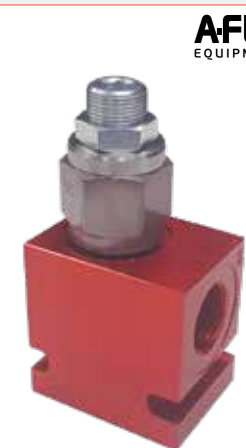
AF-ST-PRV12 1/2" Pressure Relief Valve Body & Cartridge