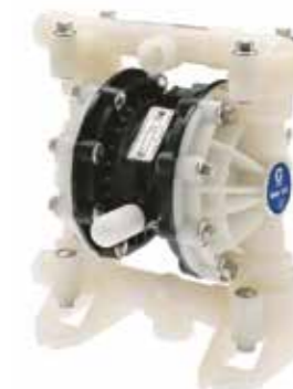
AF-G-D5B911 Graco Husky 515 Plastic Pump