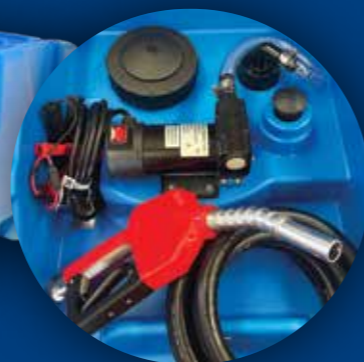
12V Standard Pump Kit POLYCUBE ECO

with 12V Standard Pump Kit 1680mm (L) x 1130mm (W) x 860mm (H) 100kg