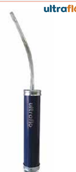
AF-AP-5010 ULTRAFLO Manual Oil Suction Gun