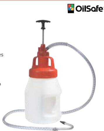
AF-OS-101010P 10L Oil Jug with Utility Lid & Hand Pump