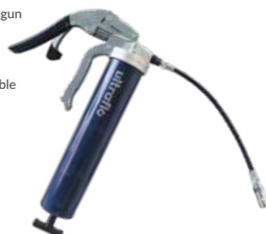
AF-UF-P450 HD Variable Pistol Grip Grease Gun - 450g