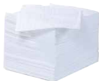
AF-SC-60020P 200GSM Oil & Fuel Pads