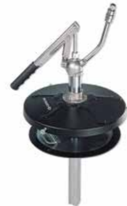
AF-UF-GFP-20 Hand Operated Bucket Pump - 20kg