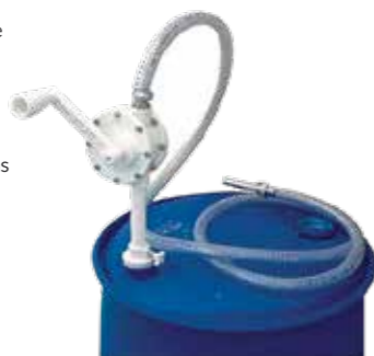
AF-FP-332080 Rotary Action Barrel Pump Kit German & US Adaptor