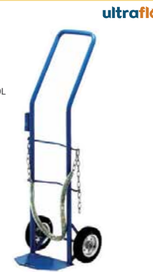
AF-AP-1303 Heavy Duty Hand Trolley 18-60kg Drums