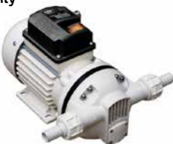
AF-FP-203010 240V Electric Transfer Pump