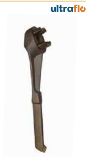
AF-AP-2315 ULTRAFLO Drum Wrench