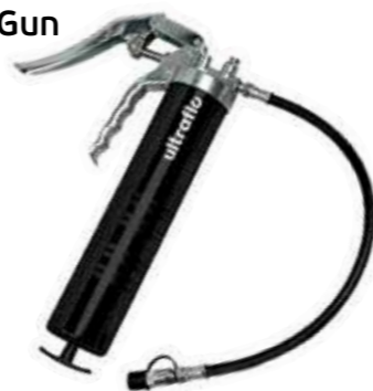
AF-AP-1152-450 Standard Pistol Grip Grease Gun - 450g