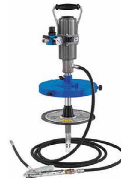
AF-AE-KP7247PZ 58:1 Ratio Grease Pump Kit - 20kg AF-AE-KP7294SCZ 58:1 Ratio Grease Pump Kit - 180kg