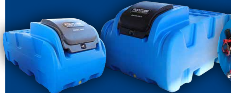
AF-FC-ECO500 500L Stumpy Diesel Tank

with 12V Standard Diesel Pump Kit & 12V Standard AdBlue Pump Kit 800mm (L) x 1100mm (W) x 700mm (H) 53kg