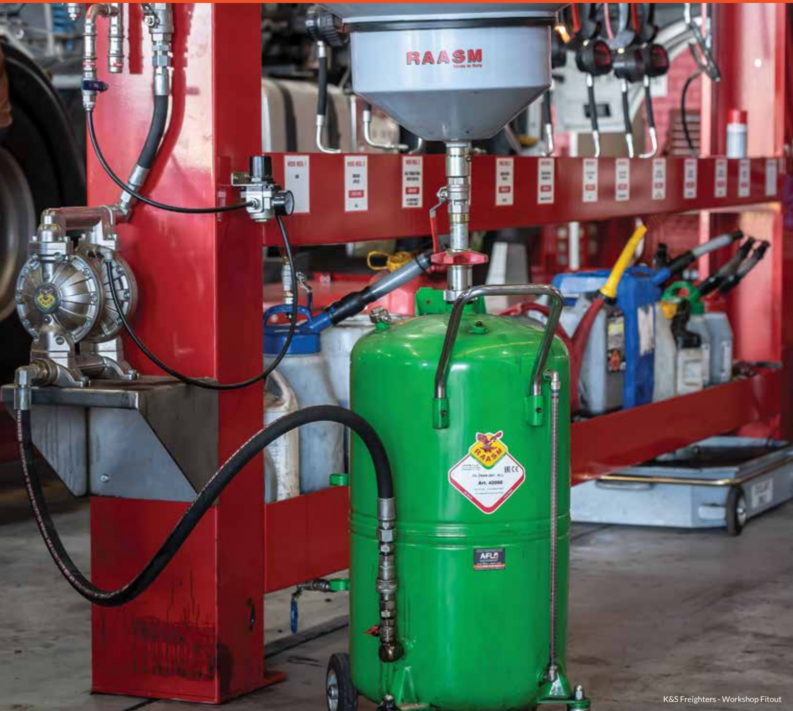
K&S Freighters - Workshop Fitout

Scan the QR code, or visit aflo.com.au/login