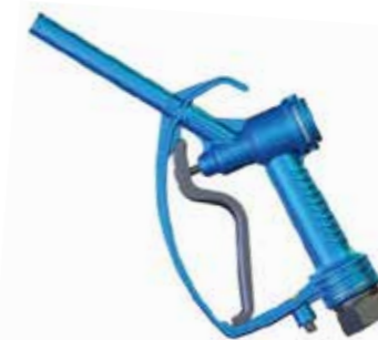
AF-AE-PPM90ADB Bluequip Manual Dispense Gun