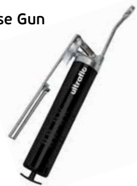
AF-AP-1142-450 Standard Lever Action Grease Gun - 450g