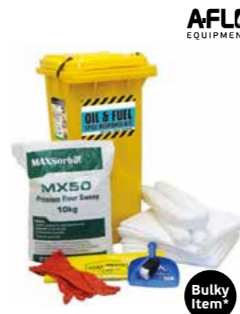
AF-SC-120B-OFSK 120L Budget Oil & Fuel Spill Kit*