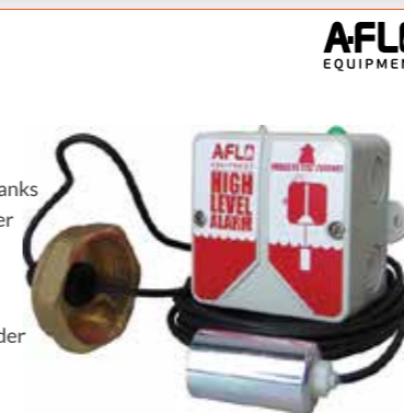
AF-HFE-HLA001 A-FLO High Level Diesel/Oil Alarm