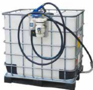
AF-FP-101320 240V 1000L IBC Kit with Auto Nozzle & Meter