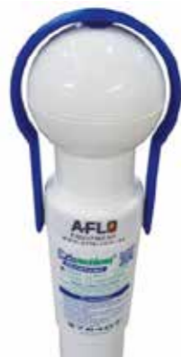
AF-EZ-25/5 25L Drum Pump