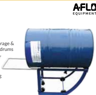
AF-AP-7425-2 HD 205L-180kg Drum Cradle